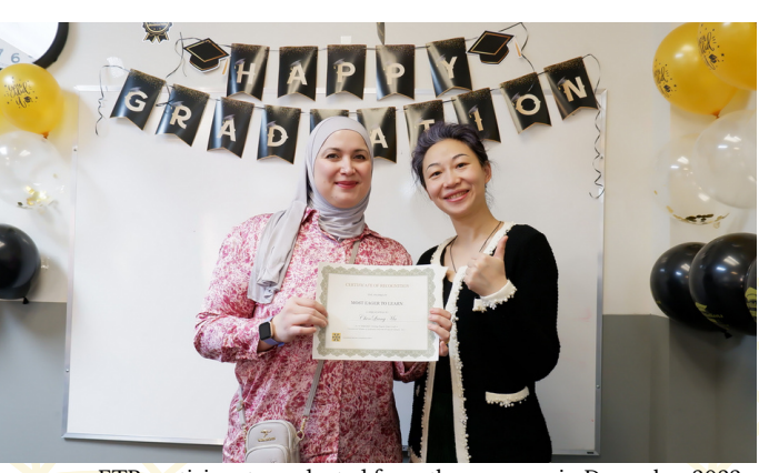
ETP participants graduated from the program in December 2022.